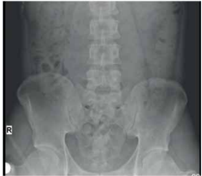
Figure 3. Pelvic radiography after voiding bullet

In this particular patient, the exploration was indicated by the general surgeons due to an intraabdominal penetrating injury. The bladder was intact radiologically,