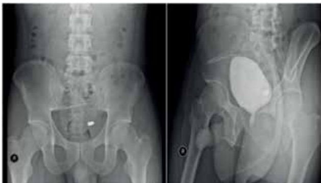
Figure 2. Bullet on left posterolateral aspect of the bladder

Gunshot wounds differ from stab wounds in terms of the consequences they cause due to the blast effect of the high-velocity bullet. Arthurs et al. (1) have reported the most lethal combination of injuries due to penetrating pelvic trauma to be hemorrhage and sepsis, vascular and rectal injury in a series of 28 patients. The American Association for the Surgery of Trauma (AAST) has developed a grading system for organ injury severity; the severity of bladder injuries is measured by an AAST organ injury severity scale (Table) (2).