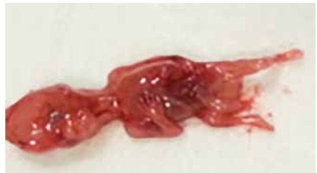
Figure 2b. Morphologic examination of twelfth weeks of gestation extracted from the rudimentary horn