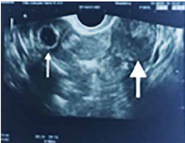
Figure 1a. A transvaginal ultrasonography of sixth weeks of pregnancy in a rudimentary horn: Thin arrow shows the gestational sac in the rudimentary horn, separate from the main uterus and the thick arrow shows the normal unicornuate uterus on the right side

The rudimentary horn and the pregnancy material were taken out of the abdomen with endobag (Figure 1c). Histopathological investigation revealed decidua and chorionic villi in the rudimentary horn, and, thus, the final diagnosis was made.