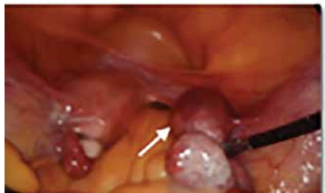
Figure 1b. Intraoperative photograph of the case: The arrow shows the non-communicating rudimentary horn that is separate from the unicornuate uterus. There is a fibrous band between these structures