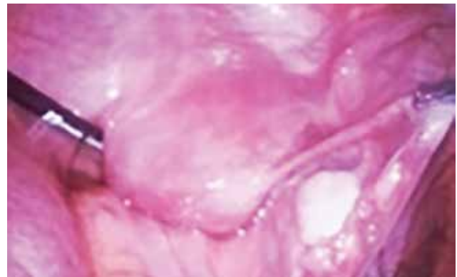
Figure 2a. Intraoperative photograph shows the rudimentary horn separated from the unicorn uterus. On the left side unicorn uterus is shown